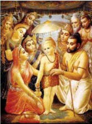
Varaha Dvadasi & Lord Vamanadeva's Appearance