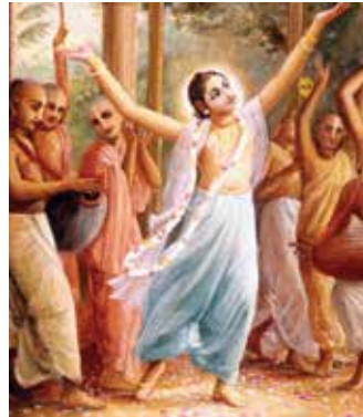
Sri Nityananda Trayodasi

7.00am Darshan 7.30am Srimad-Bhagavatam class 9.30am Bhajanas 10.30am Class on Lord Vamanadeva 12.00pm Arati and kirtana 12.30pm Feast