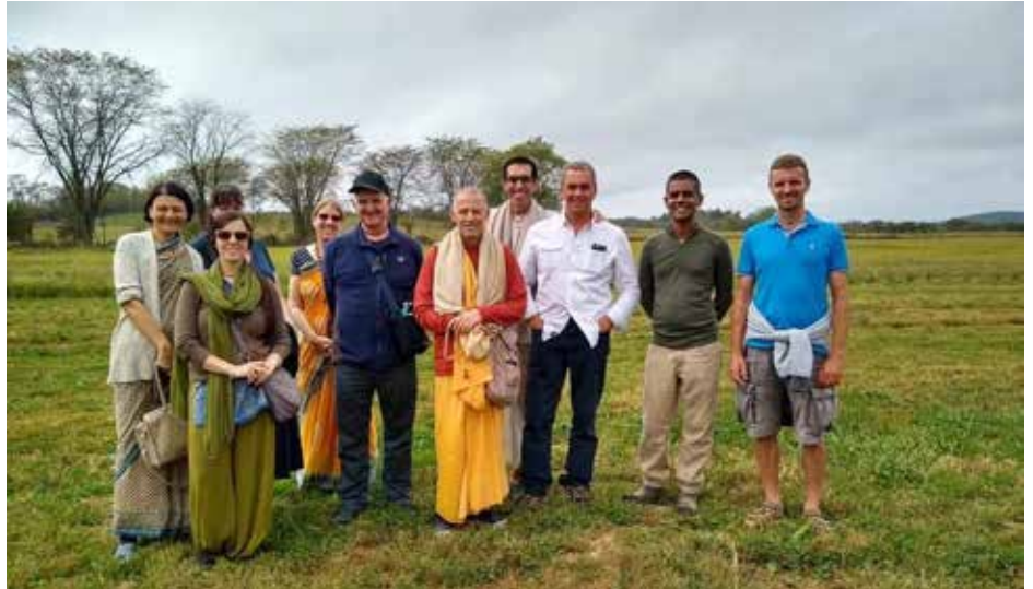
Smiling attendees from the third annual North American Farm Conference 2019 held at New Vrindaban, West Virginia.

“That’s why it is not only important but necessary that every ISKCON community, especially rural ones, include in their management plans the development of projects aimed to attract a wider variety of people that