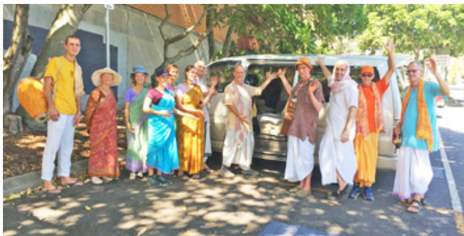
Smiles all around for the new sankirtana van.

So with our new, yet-to-be-named chariot (the last one was called the 'Blue Screamer' because everyone used to scream, "where are the keys to the blue van?"), there's lots of